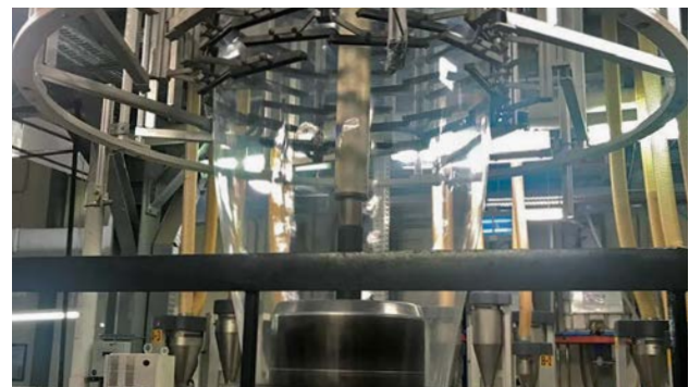
Anteo™ FK1820, FK1826 and FK1828 promote high throughput and cost-efficient processing in blown film production